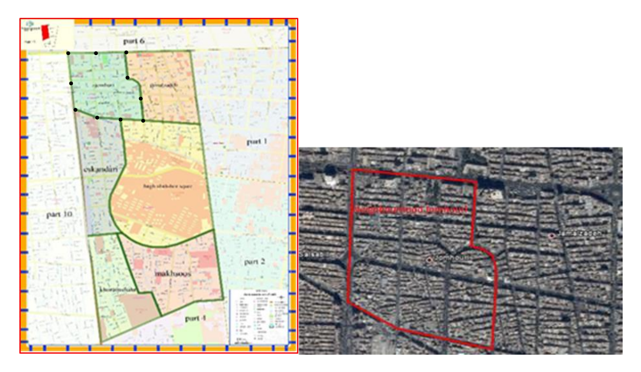
Figure 2. Jomhouri neighborhood

Jomhouri neighborhood is located at neighborhood 1 of district.11 and county.3. From north it is limited to Azadi St, from south it is limited to Azerbaijan St, from west it is limited to Shahid Navab Safavi St and from east it is limited to Zare St and Golshan St and this neighborhood has area of 0.45km. The history of formation of this neighborhood goes back to Mohammad Reza Shah Pahlavi and development of Tehran from borders of Karegar St, construction of new buildings and residing ever-growing number of immigrants to Tehran and this neighborhood was turned into residential neighborhood.