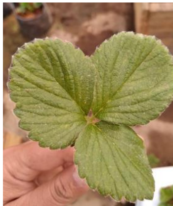
Figure 2. Spider mites ( Tetranychus urticae ) were observed and eradicate from the strawberry plants.

Additionally, during the experimental stage spider mites " Tetranychus urticae " were observed in the strawberry leaves (Figure 2), thus the plague was initially controlled with a biological control powder which contains spores and metabolites of Bacillus thuringiensis . However, the biological treatment did not affect the T. urticae and thus sulfur was applied to kill the pest. This proper pest control was carried during 60 days before the experiment to eradicate T. urticae which could produce harmful effects on the strawberry plants (Sances et al. , 1982). Therefore, T. urticae did not cause any damage to the strawberry plants during the experimental stage.